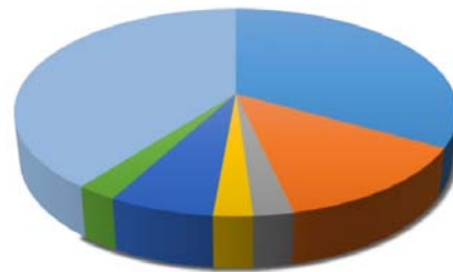
Classification by Title